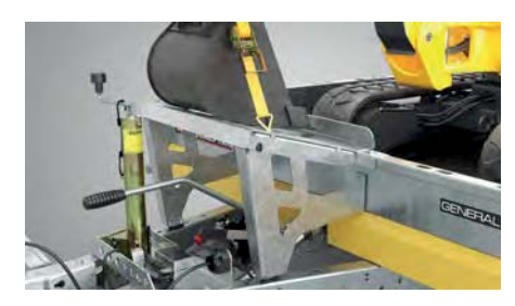
DIGGER BUCKET REST